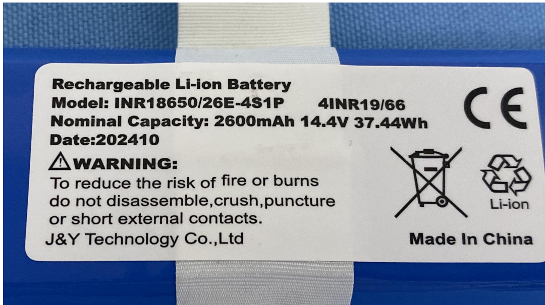
Figure 4 Battery label (电池标签)