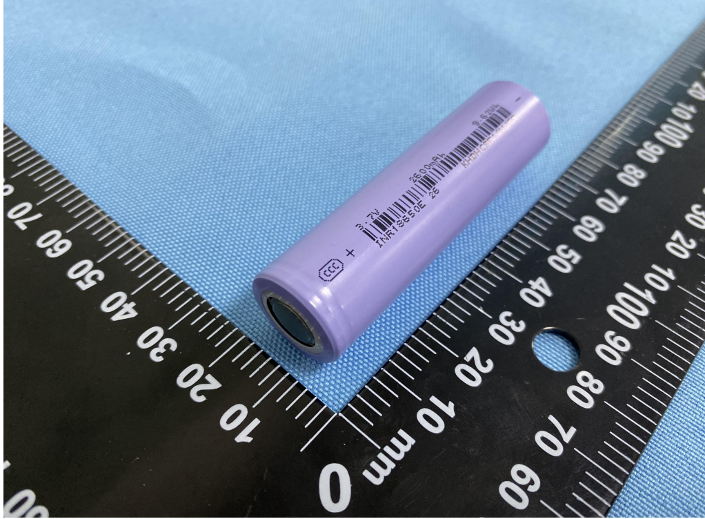
Figure 3 Overall view of cell (电芯外观图)