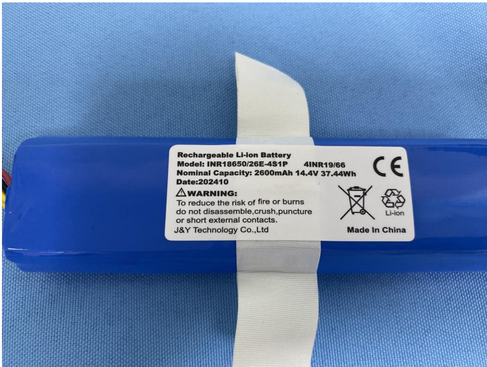
Figure 4 Battery label (电池标签)