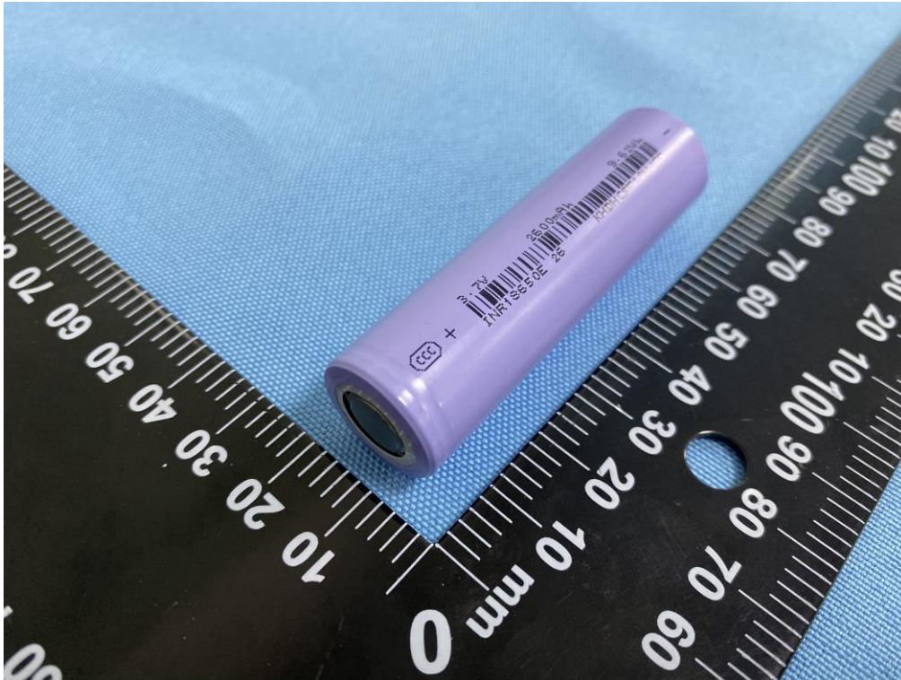
Figure 3 Overall view of cell (电芯外观图)